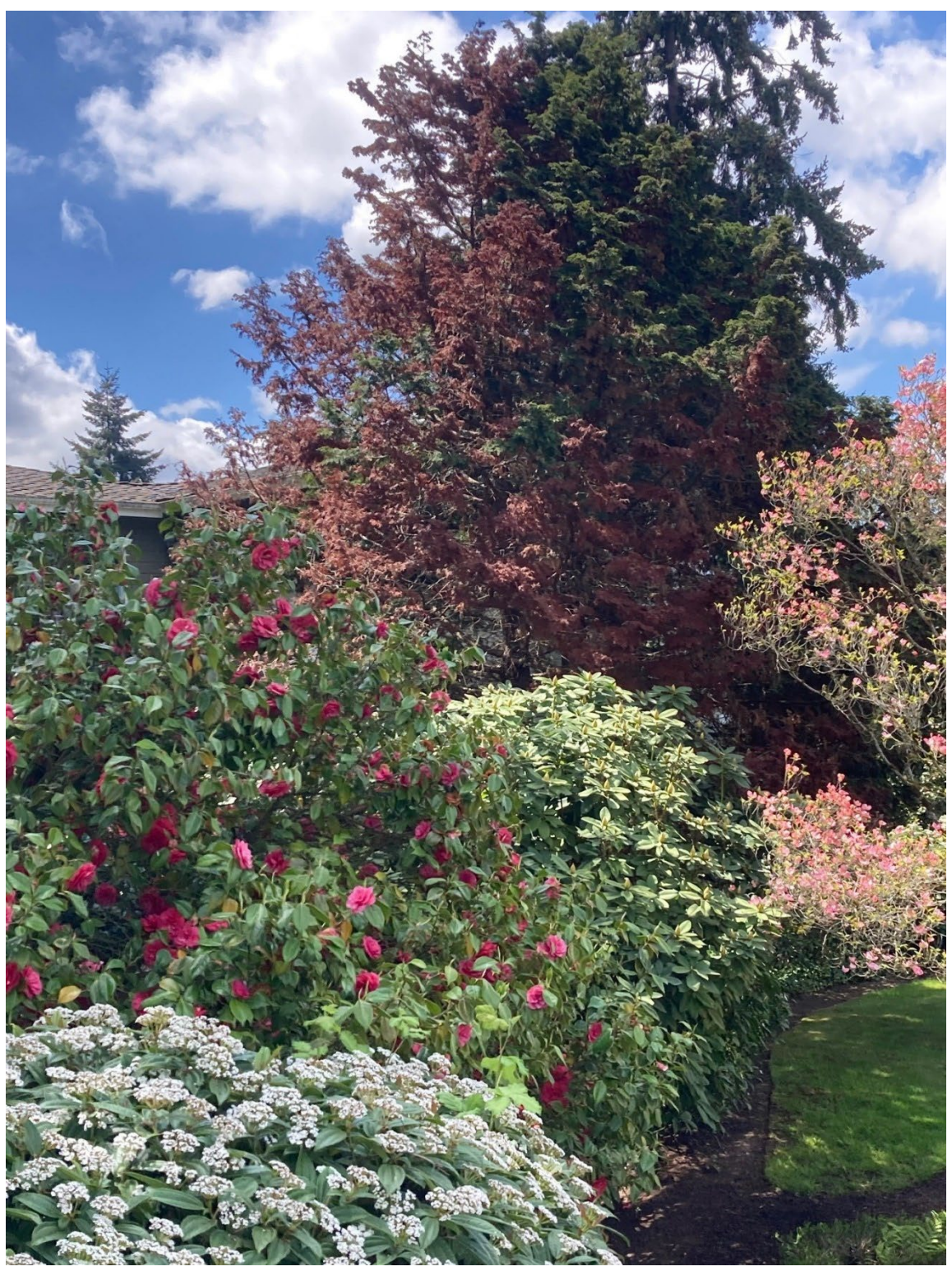
Figure 3. Tree #11, Hinoki cypress in Poor condition with significant canopy dieback.