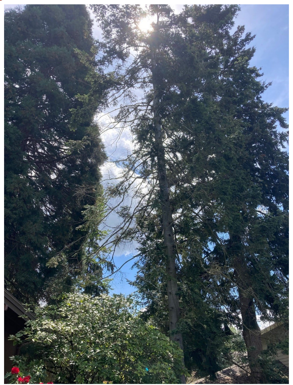
Figure 2. Tree #9, silver fir in Poor condition with significant canopy dieback.