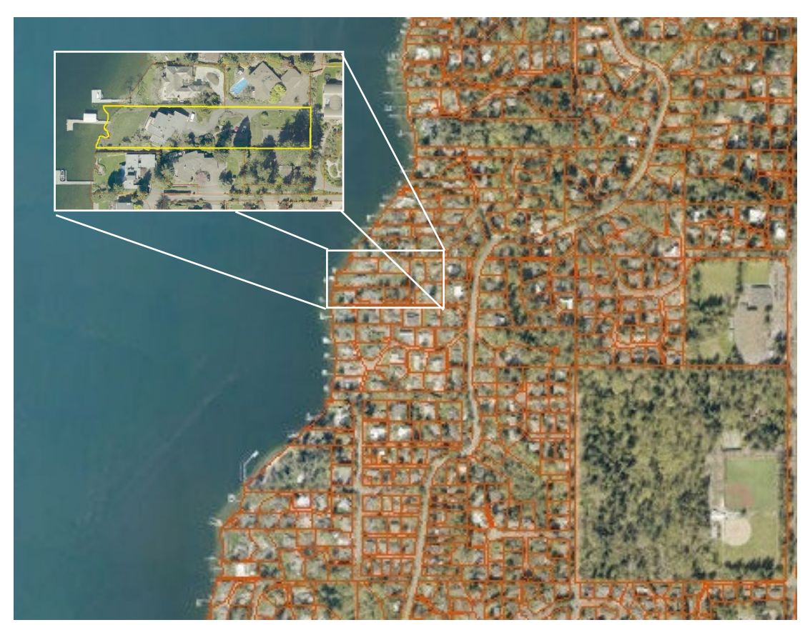
Figure 1. Vicinity map showing study area (parcel boundary highlighted in yellow).

The study area includes the subject property and adjacent trees with overhanging driplines which may be affected by the proposed project. The subject property totals approximately 42,797 square feet in size (according to King County Assessor) and is currently developed with a single-family residence, detached structures, associated hardscaping and ornamental landscaping. Single-family residential parcels border the subject property to the north, east, and south. Lake Washington borders the property to the west. The site is zoned single-family residential (R-15) and falls within 200 feet of the shoreline of Lake Washington. See Figure 1 for a map of the study area and site vicinity.