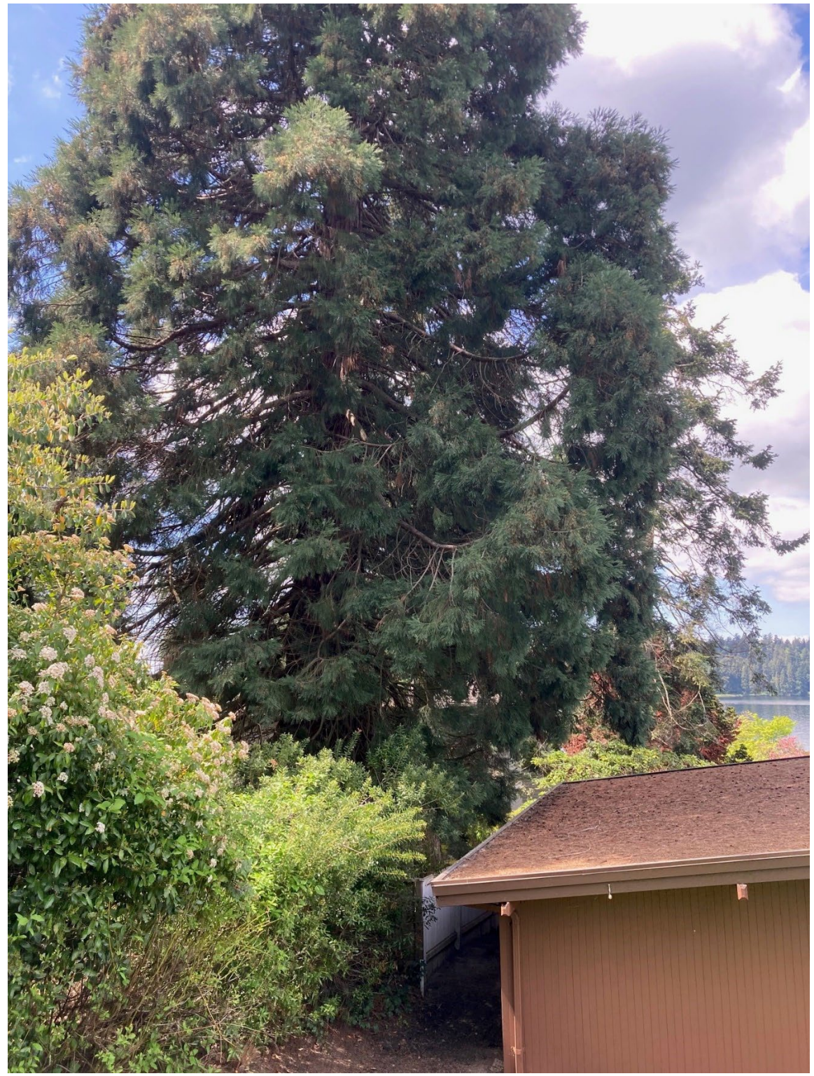
Figure 4. Tree #8, off-site giant sequoia near current garage.